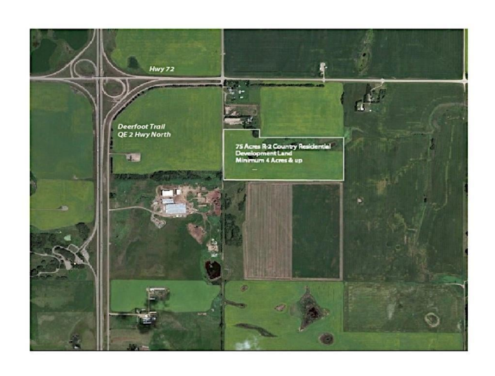
Subject Property 75.07 Acers

75 Acres in MD of Rockyview, a Great INVESTMENT Opportunity, the perfect place to build your dream home, Minutes from Booming Airdrie, Balzac Mega Mall, and 15 minutes from Calgary City Limits. It is Currently Zoned R-RUR / A-SML. With county approval, you may be able to subdivide into 9-15 Parcels. A minimum of 4-acre parcels each and one 13-acre parcel for your dream home. This Beautiful parcel of rolling land offers unobstructed Mountains, partial Calgary views, and a pond. This location has easy access just off Hwy QE2 easy. Minutes from the Cross Iron Mills Shopping Centre in Balzac. Already Zoned for R-RUR / A-SML. The land could be rented to a local farmer. for $95 per acre. Don't Miss this Opportunity!!!!!