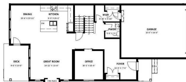
MAIN 1,085 SQ.FT. GARAGE 477 SQ. FT.