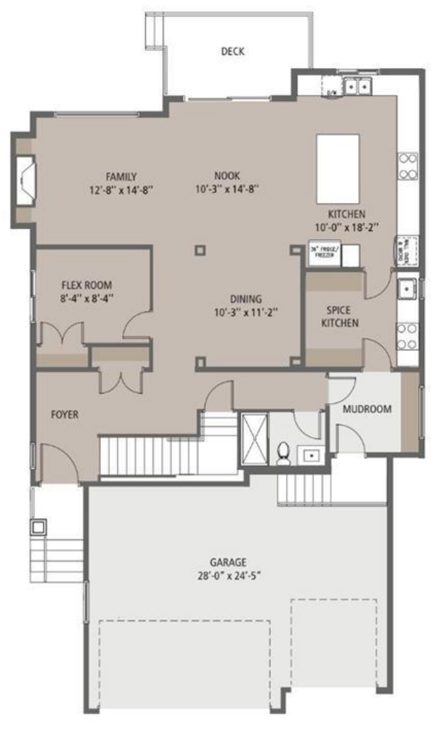
MAIN FLOOR: 1353 SQ.FT